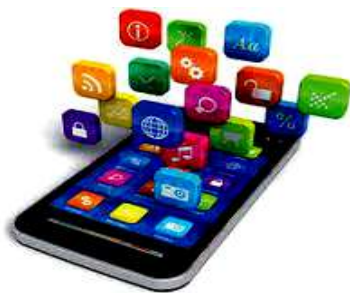
Figure 1: Mobile App

It is foreseeable that machine learning could construct perfect hypotheses to illuminate its manifestations. Due to the fact that there is a lot of information on the planet but it is not necessary to give each piece of data a name, its unsupervised learning capabilities will be enhanced in the interim. In order for brain system structures to distinguish the more semantically significant details, it is also expected that they would become more unexpected. Furthermore, deep learning will solidify with improved adaptation support, and we can use these places of interest to complete more assignments.