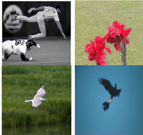
Fig 2: Clockwise from top left images: Birds1, Birds2, Game1 and Flower1.