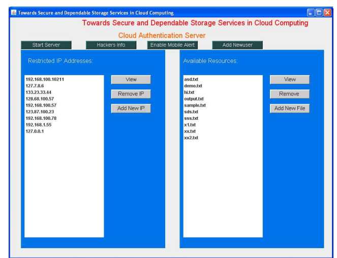
Fig.3. SS3 -Available Resources