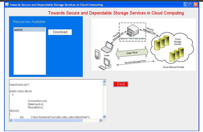
Fig.5. SS9 – Downloading Information Available On Resource