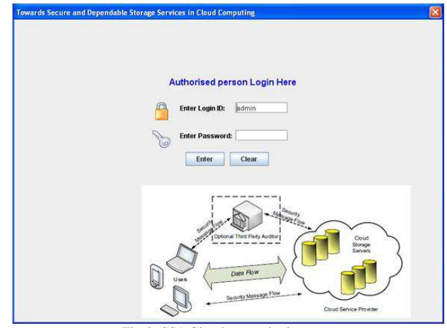
Fig.2. SS1:Cloud server login page