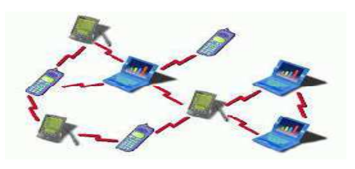
Fig 1.1 Wirelesses MANET

multihop. In a single-hop network, all nodes within the same radio range communicate directly with each other. On the other hand, in a multihop network, nodes rely on other intermediate nodes to transmit if the destination node is out of their radio range.