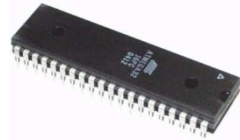
Figure 3. ATMEGA controller – 40 pin IC.

The ATMEGA48PA/88PA/168PA/328P is a low-power CMOS 8-bit microcontroller based on the AVR enhanced RISC architecture. While executing powerful instructions in a single clock cycle, the ATmega48PA/88PA/168PA/328P can achieve throughputs approaching 1 MIPS per MHz allowing the system designers to optimize power consumption with the processing speed.