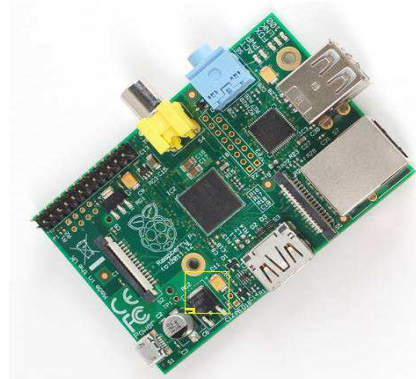
Figure 8. Raspberry Pi module.

The raspberry pi is a credit card- sized single board computer developed in the UK by the Raspberry Pi Foundation. The raspberry pi has a Broadcom BCM 2835 system on chip (SoC).which includes an ARM1176JZF-S700 MHz processor. The firmware includes a number of “turbo” modes so the user can attempt overclocking, Up to 1GHz, without affecting the board. Video Core IV GPU was originally manufactured with 256 megabytes of RAM, later it was upgraded to 512MB. It does not include built in hard disk or solid state drive, but raspberry pi uses an SD card for booting and long term storage.