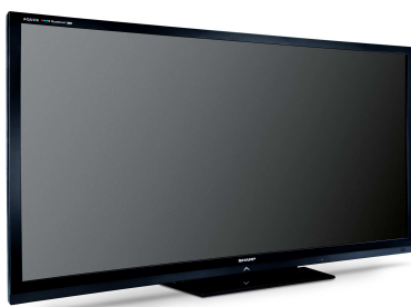
Figure 11. High definition screen at base station for monitoring the request.

There are two main connection options for the raspberry pi display, HDMI (high definition) and Composite (low definition).