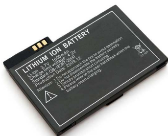
Figure 7. Li-ion battery for hand held transceiver.

The power supply unit has to be very small in size as well as with sufficient power for the hand held transceiver to run for much longer time. For this purpose, LI ion battery is used.