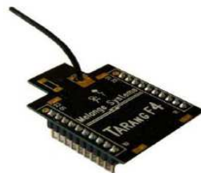
Figure 4. Tarang RF Transceiver module.

Tarang module are designed with low to medium transmit power and for high reliability wireless networks. These tarang modules require minimal power and provide reliable delivery of data between devices. These modules operate within the ISM 2.4-2.4835 GHz frequency band with standard IEEE 802.15.4 base band.