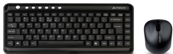
Figure 9. Wireless keyboard and mouse.

Most standard USB keyboards and mice will work with the raspberry pi.