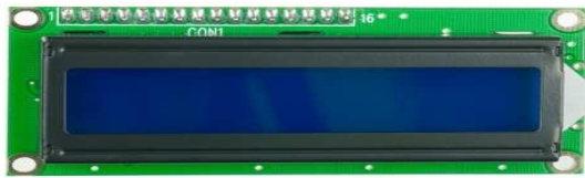
Figure 5. 16x2 LCD display.

The display unit here is the 16x2 LCD display, which has features with 16 characters, 2 lines display, and 5x8 dots with cursor. It has built in controller with display mode and backlight variations. Interfaces are 4 bit or 8bit MPU. Its operating voltage is at 7.0V.