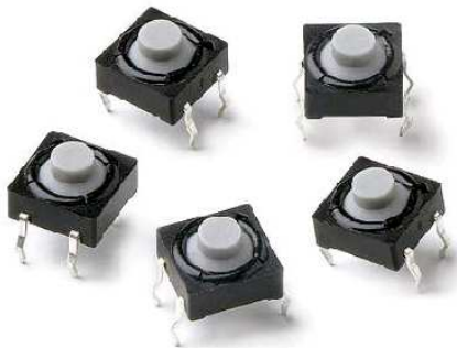
Figure 6. Tactile switches.

Tactile switches are the small switches which are very small in size, low power absorber, good tactility. These can be used for on/off purposes, these are used in applications in which the scaling is very small.