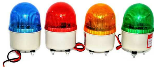
Figure 10. Buzzers with different color lamps.

Alarm unit consists of the beeping buzzer and different colored lamps.